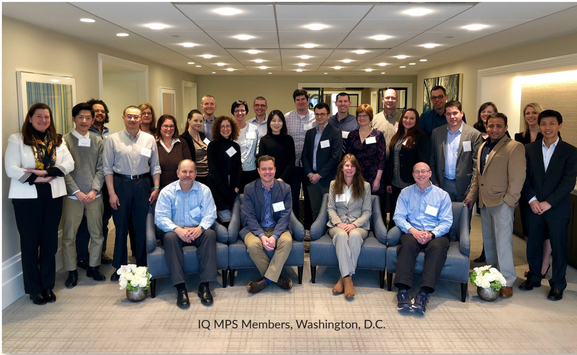
IQ MPS Members, Washington, D.C.